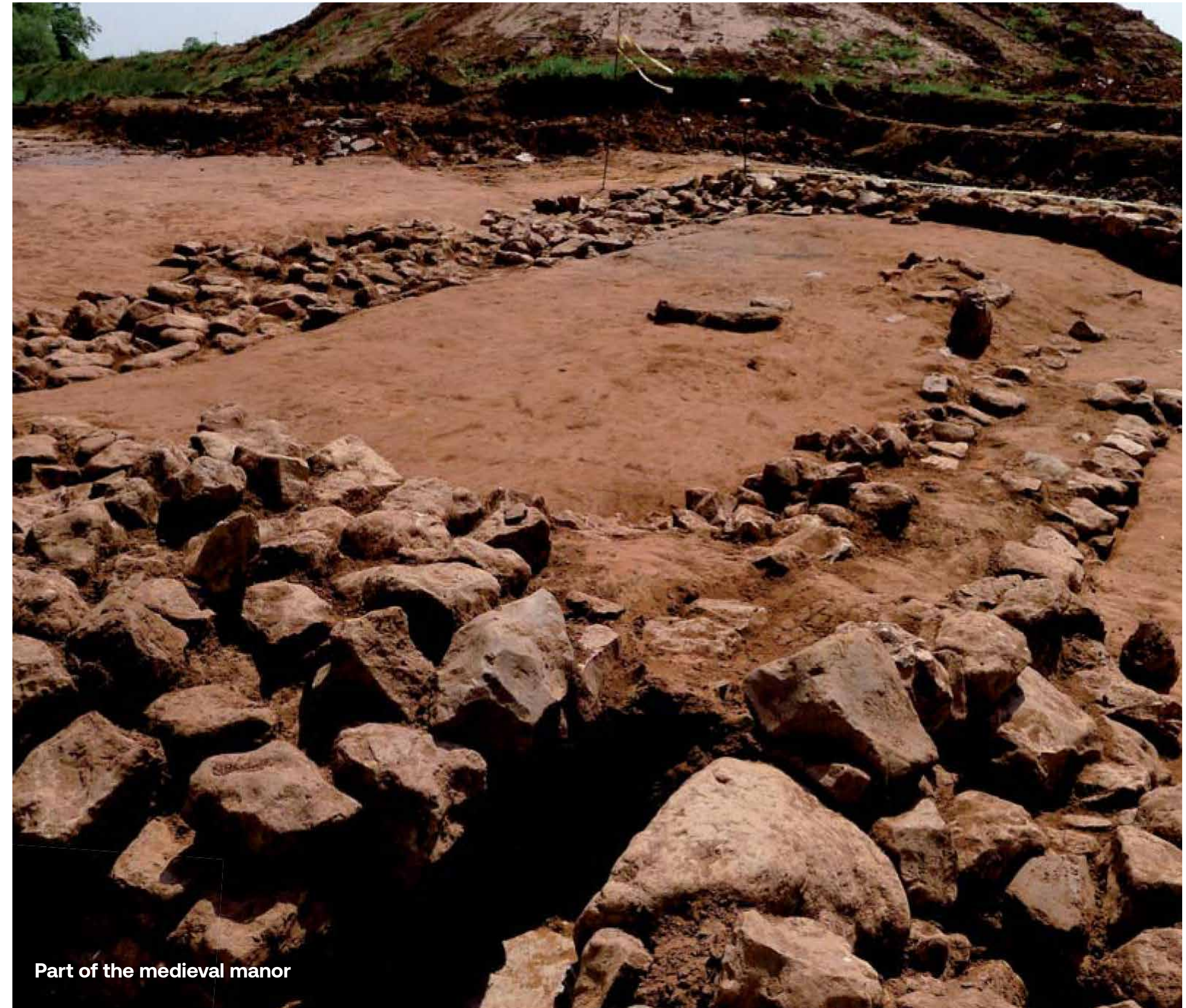
Part of the medieval manor

This discovery generated an exceptional level of local interest, and a series of public engagement events were held, including a community open day and visits attended by local schools and all interested local history societies, which resulted in significant positive press coverage for both the housebuilders and the archaeological contractor.